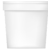
Straight / Tapered Buckets