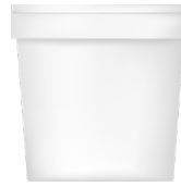
Straight / Tapered Buckets