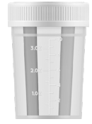
Tamper Evident Containers