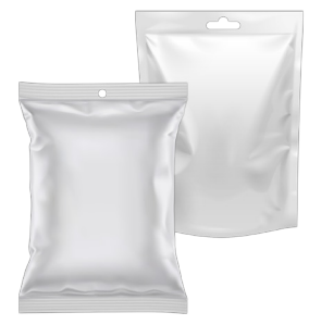
Various Hole-Punch & Tear Notching