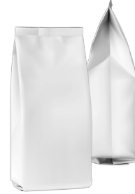
Flat Bottom Bag