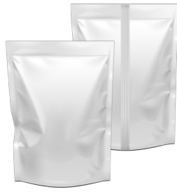
Doy-Style Stand-up Bag