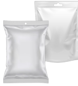
Various Hole-Punch & Tear Notching